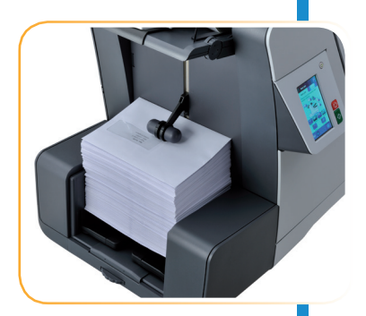
High-capacity vertical envelope stacker holds up to 250 finished pieces