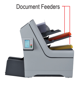
6206-Basic 2 Two Document Feeders