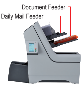
6206-Basic 1 One Document Feeder

OMR/BCR are available options, and the 6206 Series has advanced scanning capabilities to read codes printed horizontally or vertically, anywhere on the page.