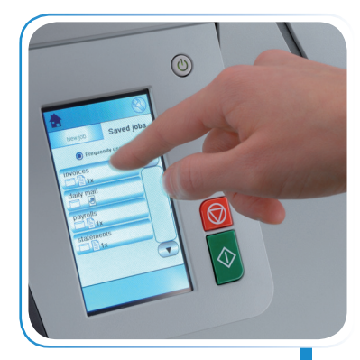
User-friendly color touchscreen control panel with job set-up wizard