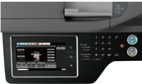
High-resolution touch screen with Stylus pen for easy point-and-touch operation