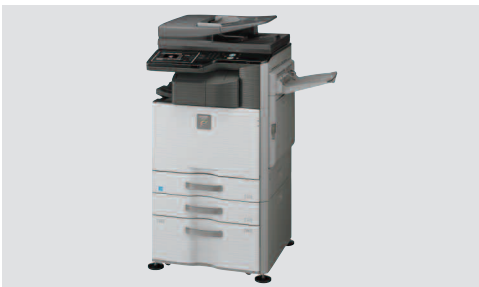
Available paper capacity stores up to a maximum of 3,100 sheets with options