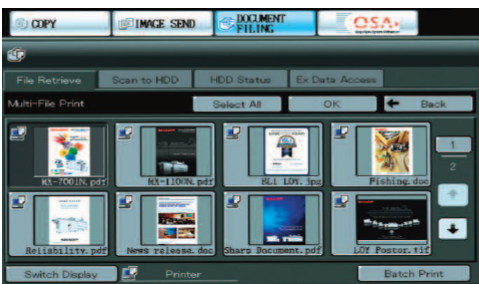
Sharp's easy-to-use Document Filing System with thumbnail preview